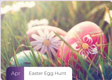
Apr Easter Egg Hunt