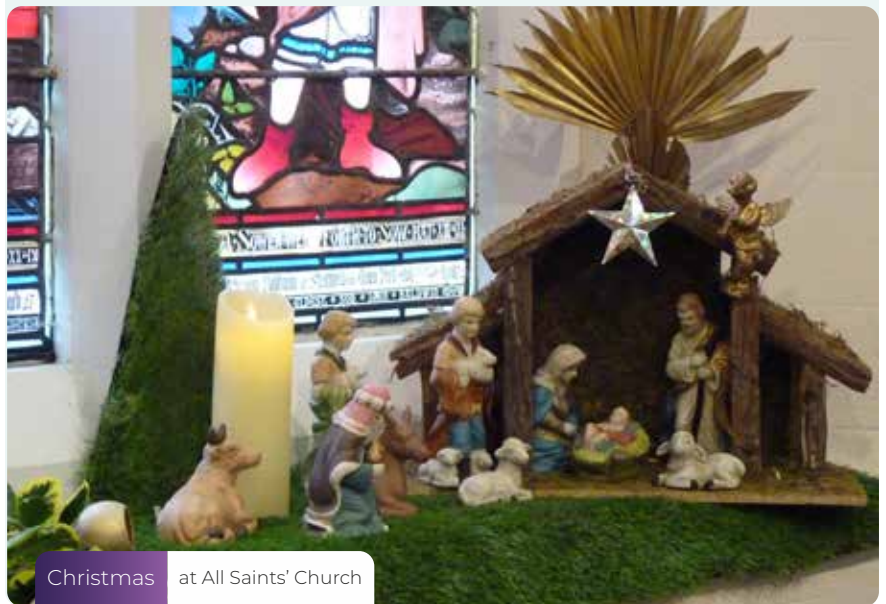
Christmas at All Saints' Church

Christmas falls on a Sunday this year and the Christmas Day service will be at 9.30am. There will be no service at All Saints on 1 January, but there will be an All Parish service at Holy Trinity at 10.00am. We wish you a very merry Christmas.