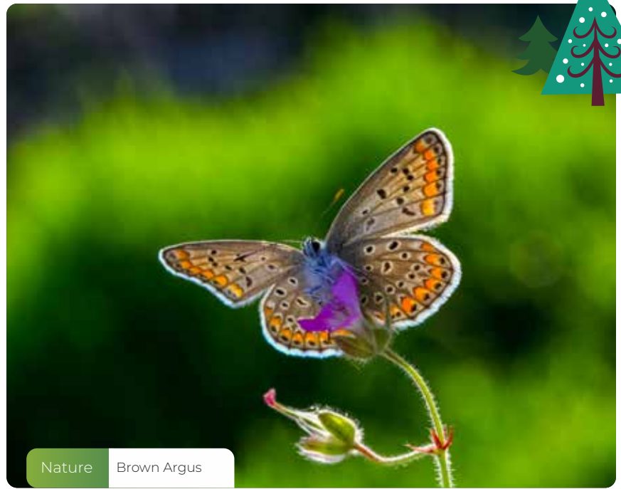
Nature Brown Argus

In addition to tree planting, our amazing army of volunteers help us with all aspects of creating and managing the Forest, all year round, including forest restoration, wildlife surveying, and assisting with our public events. Regular activities take place most weeks from Monday to Saturday. To find out more, visit heartofenglandforest.org/volunteer