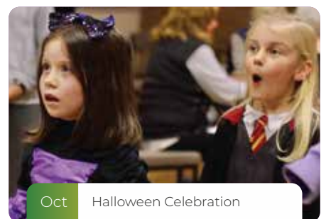
Oct Halloween Celebration