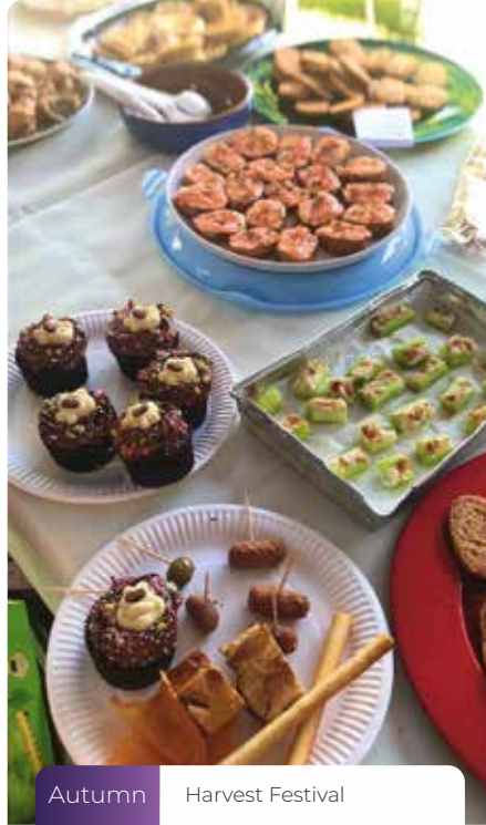
Autumn Harvest Festival

Thank you to all who made our Harvest Festival such a success. The church was beautifully decorated by the Flower Team and after a lovely service with members of Holy Trinity Choir, refreshments were provided in the warm and sunny churchyard. Items were brought and donated to the Food Bank.