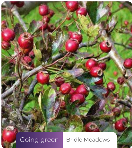
Going green Bridle Meadows

In recent weeks our attention has been drawn to the Earthshot Awards, COP26 summit and the latest IPCC Climate Report. The rise in global temperatures from CO 2 and greenhouse gases is predicted to hit hard and 10 years earlier than the last assessment in 2018.