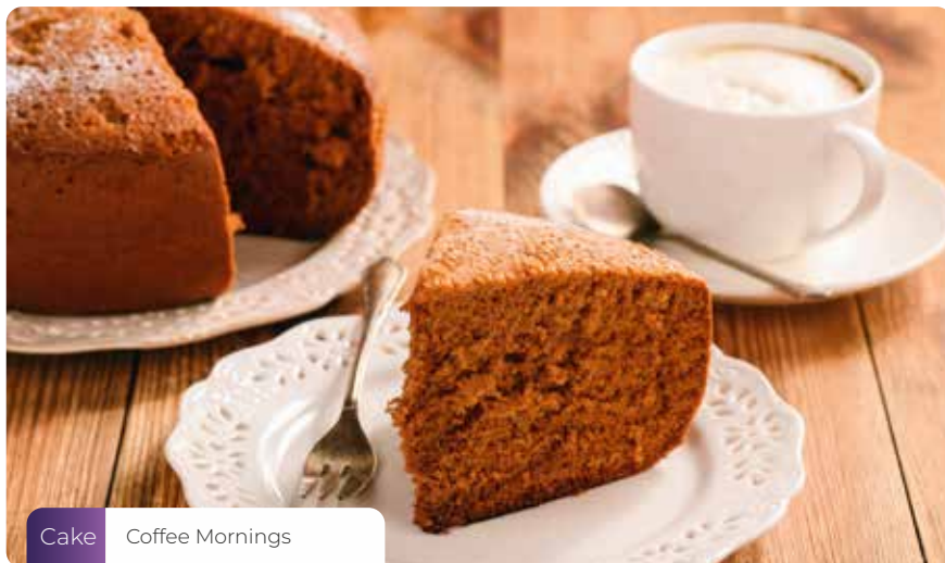
Cake Coffee Mornings

UPDATE | from your Village Hall Committee